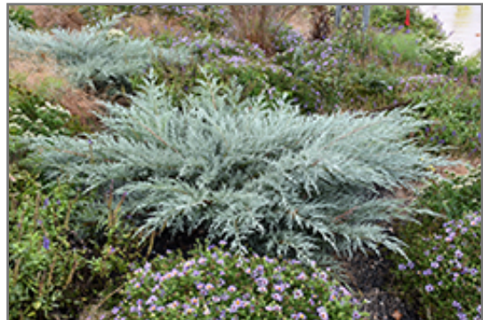
Grey Owl Redcedar