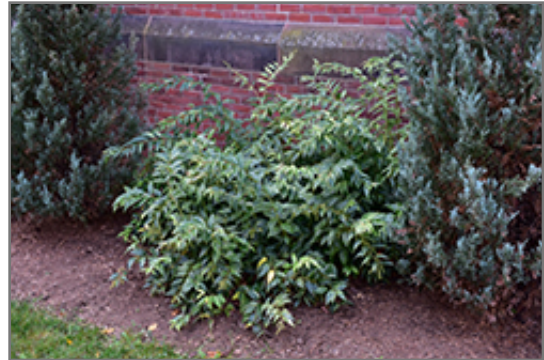
Rainbow Fetterbush