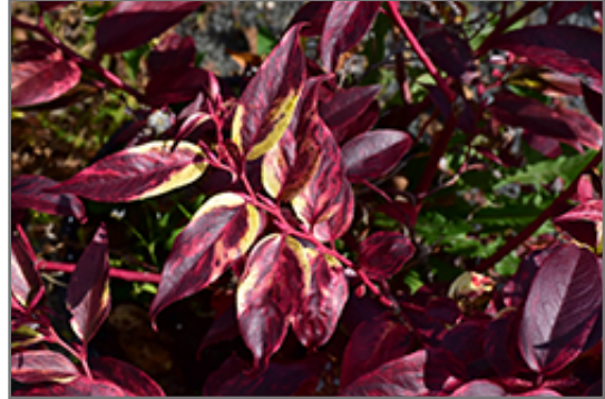
Rainbow Fetterbush in fall

Rainbow Fetterbush makes a fine choice for the outdoor landscape, but it is also well-suited for use in outdoor pots and containers. Because of its height, it is often used as a 'thriller' in the 'spiller-thriller-filler' container combination; plant it near the center of the pot, surrounded by smaller plants and those that spill over the edges. It is even sizeable enough that it can be grown alone in a suitable container. Note that when grown in a container, it may not perform exactly as indicated on the tag - this is to be expected. Also note that when growing plants in outdoor containers and baskets, they may require more frequent waterings than they would in the yard or garden.