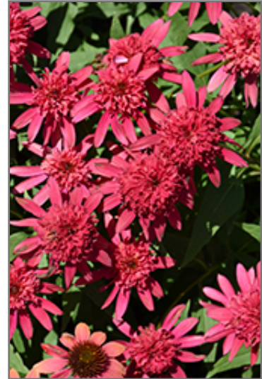
Double Scoop Raspberry Coneflower flowers