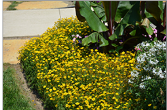
Goldilocks Rocks Bidens in bloom