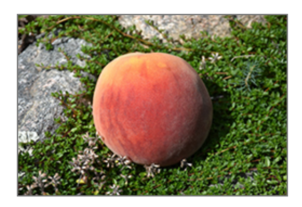
Frost Peach fruit

Frost Peach is smothered in stunning clusters of fragrant hot pink flowers along the branches in early spring, which emerge from distinctive dark red flower buds before the leaves. It has dark green deciduous foliage. The narrow leaves turn yellow in fall. The fruits are showy chartreuse drupes with a scarlet blush, which are carried in abundance in mid summer. The fruit can be messy if allowed to drop on the lawn or walkways, and may require occasional clean-up.