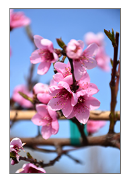
Frost Peach flowers