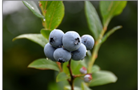
Northsky Blueberry fruit

Northsky Blueberry features dainty clusters of white bell-shaped flowers with shell pink overtones hanging below the branches in mid spring. It has green deciduous foliage. The glossy oval leaves turn an outstanding scarlet in the fall. It features an abundance of magnificent blue berries in mid summer.