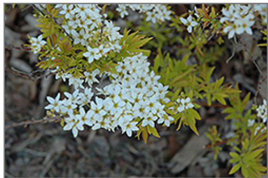
Mellow Yellow Spirea flowers