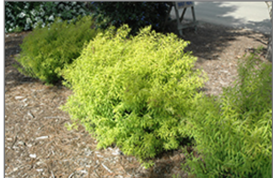
Mellow Yellow Spirea

Mellow Yellow Spirea is recommended for the following landscape applications;