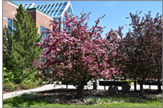
Makamik Flowering Crab in bloom

Makamik Flowering Crab is recommended for the following landscape applications;