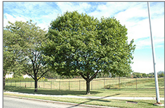
Norway Maple