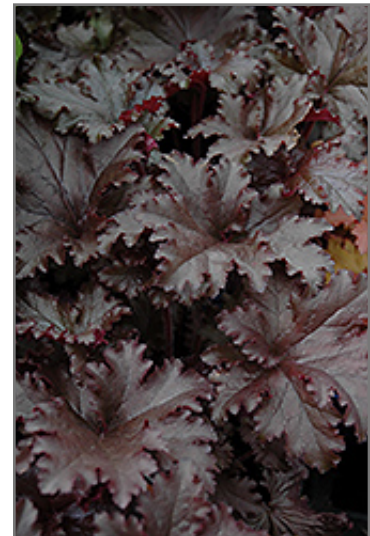
Black Taffeta Coral Bells foliage

Black Taffeta Coral Bells is recommended for the following landscape applications;