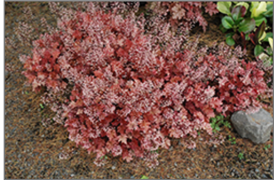
Peach Crisp Coral Bells in bloom

Peach Crisp Coral Bells is recommended for the following landscape applications;