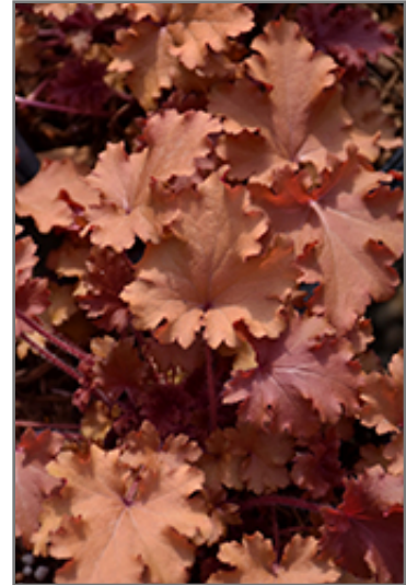
Peach Crisp Coral Bells foliage

Peach Crisp Coral Bells will grow to be about 14 inches tall at maturity extending to 20 inches tall with the flowers, with a spread of 18 inches. When grown in masses or used as a bedding plant, individual plants should be spaced approximately 15 inches apart. Its foliage tends to remain dense right to the ground, not requiring facer plants in front. It grows at a medium rate, and under ideal conditions can be expected to live for approximately 10 years. As an evergreen perennial, this plant will typically keep its form and foliage year-round.