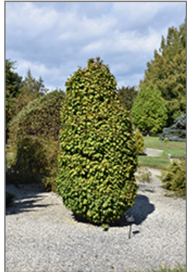
Columnaris Nana Hornbeam