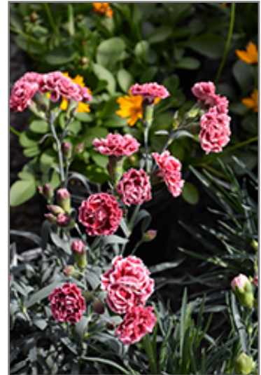
Scent First Sugar Plum Pinks flowers