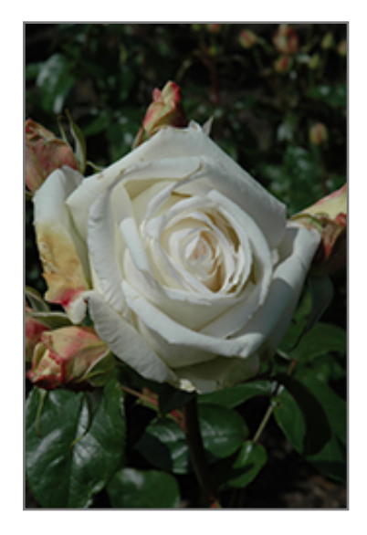
Full Sail Rose flowers