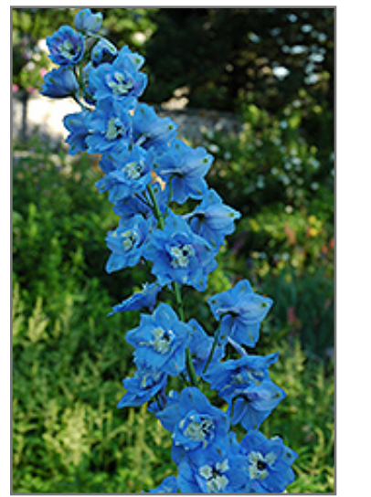
Pacific Giant Summer Skies Larkspur flowers