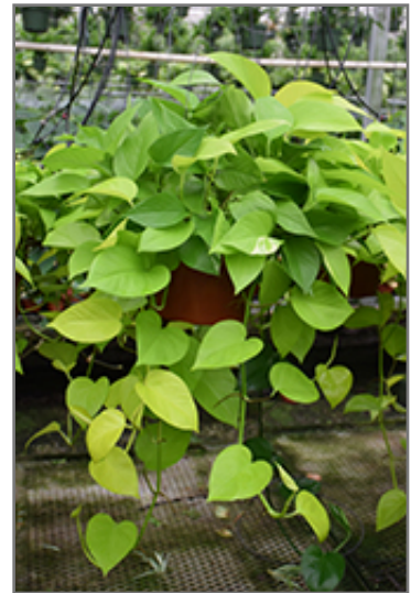
Neon Pothos in full

When grown indoors, Neon Pothos can be expected to grow to be about 5 feet tall at maturity, with a spread of 24 inches. It grows at a fast rate, and under ideal conditions can be expected to live for approximately 10 years. This houseplant performs well in both bright or indirect sunlight and strong artificial light, and can therefore be situated in almost any well-lit room or location. It does best in average to evenly moist soil, but will not tolerate standing water. The surface of the soil shouldn't be allowed to dry out completely, and so you should expect to water this plant once and possibly even twice each week. Be aware that your particular watering schedule may vary depending on its location in the room, the pot size, plant size and other conditions; if in doubt, ask one of our experts in the store for advice. It is not particular as to soil type or pH; an average potting soil should work just fine. Be warned that parts of this plant are known to be toxic to humans and animals, so special care should be exercised if growing it around children and pets.