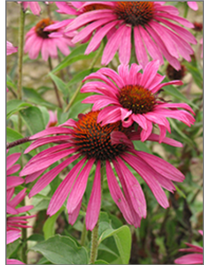
Ruby Star Coneflower flowers