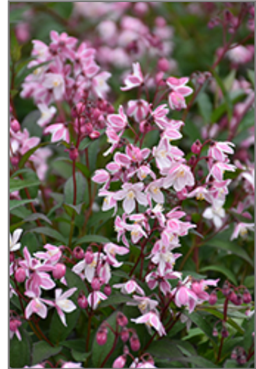
Yuki Cherry Blossom Deutzia flowers