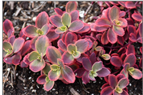
Sunsparkler Wildfire Stonecrop foliage