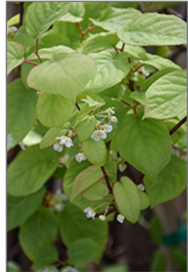
Variegated Hardy Kiwi Vine flowers