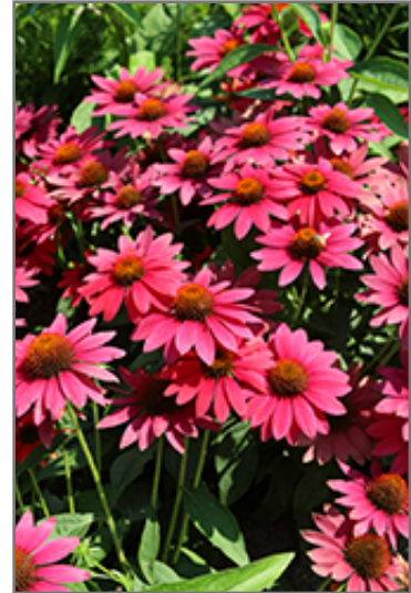
Sombrero Tres Amigos Coneflower flowers

This is a relatively low maintenance plant, and is best cleaned up in early spring before it resumes active growth for the season. It is a good choice for attracting butterflies to your yard, but is not particularly attractive to deer who tend to leave it alone in favor of tastier treats. It has no significant negative characteristics.