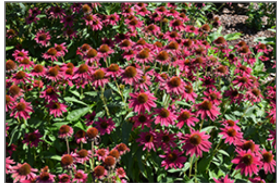
Sombrero Tres Amigos Coneflower in bloom