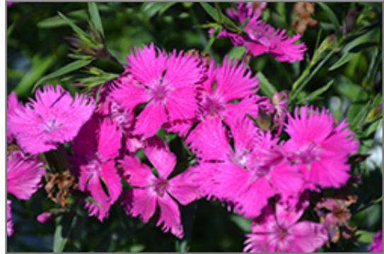
Rockin' Purple Pinks flowers

This is a relatively low maintenance plant, and is best cleaned up in early spring before it resumes active growth for the season. It is a good choice for attracting bees and butterflies to your yard, but is not particularly attractive to deer who tend to leave it alone in favor of tastier treats. It has no significant negative characteristics.