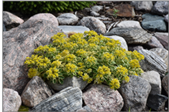
Atlantis Stonecrop in bloom