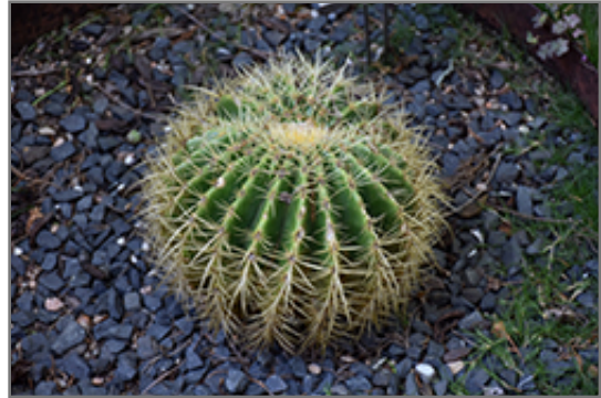
Golden Barrel Cactus

Golden Barrel Cactus is a succulent evergreen plant. It is a member of the cactus family, which are grown primarily for their characteristic shapes, their interesting features and textures, and their high tolerance for hot, dry growing environments. Like all cacti, it doesn't actually have leaves, but rather modified succulent stems that comprise the bulk of the plant, and which are designed to hold water for long periods of time. This particular cactus is valued for its distinctive barrel shape, and usually grows as a single spiny ribbed green stem. This plant has yellow cup-shaped flowers held atop the stems from late spring to early summer, which are interesting on close inspection.