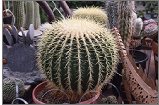
Golden Barrel Cactus in full

Golden Barrel Cactus is a succulent evergreen plant. It is a member of the cactus family, which are grown primarily for their characteristic shapes, their interesting features and textures, and their high tolerance for hot, dry growing environments. Like all cacti, it doesn't actually have leaves, but rather modified succulent stems that comprise the bulk of the plant, and which are designed to hold water for long periods of time. This particular cactus is valued for its distinctive barrel shape, and usually grows as a single spiny ribbed green stem. This plant has yellow cup-shaped flowers held atop the stems from late spring to early summer, which are interesting on close inspection.