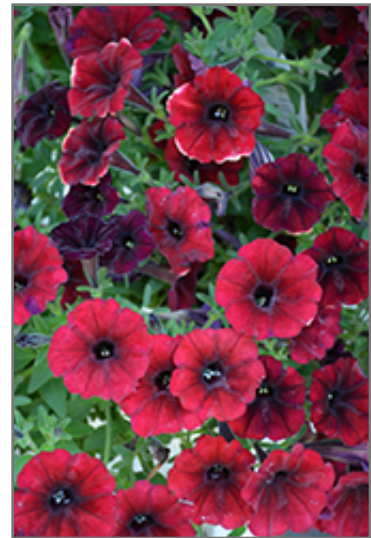
Supertunia Black Cherry Petunia flowers

This plant will require occasional maintenance and upkeep. Trim off the flower heads after they fade and die to encourage more blooms late into the season. It is a good choice for attracting butterflies and hummingbirds to your yard, but is not particularly attractive to deer who tend to leave it alone in favor of tastier treats. It has no significant negative characteristics.