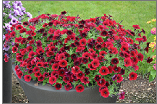
Supertunia Black Cherry Petunia in bloom

Supertunia Black Cherry Petunia will grow to be about 10 inches tall at maturity, with a spread of 24 inches. When grown in masses or used as a bedding plant, individual plants should be spaced approximately 16 inches apart. Its foliage tends to remain low and dense right to the ground. This fast-growing annual will normally live for one full growing season, needing replacement the following year.