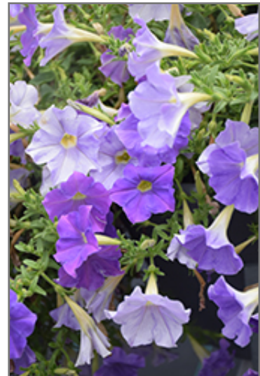
Supertunia Blue Skies Petunia flowers

Supertunia Blue Skies Petunia is recommended for the following landscape applications;