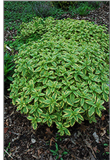
Golden Alexander Loosestrife