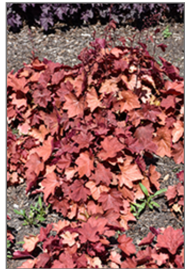
Carnival Cinnamon Stick Coral Bells