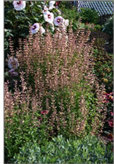
Meant To Bee Queen Nectarine Anise Hyssop in bloom

Meant To Bee Queen Nectarine Anise Hyssop is a fine choice for the garden, but it is also a good selection for planting in outdoor pots and containers. With its upright habit of growth, it is best suited for use as a 'thriller' in the 'spiller-thriller-filler' container combination; plant it near the center of the pot, surrounded by smaller plants and those that spill over the edges. It is even sizeable enough that it can be grown alone in a suitable container. Note that when growing plants in outdoor containers and baskets, they may require more frequent waterings than they would in the yard or garden.