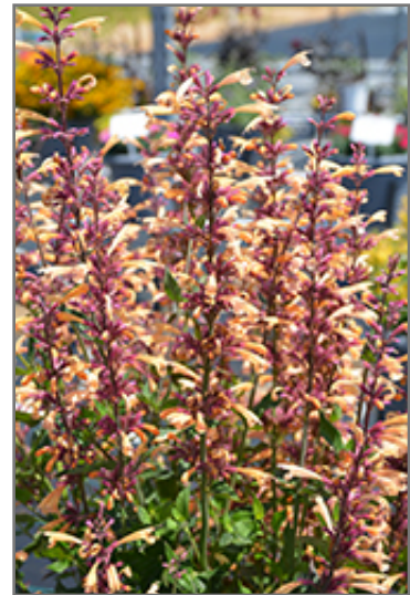
Meant To Bee Queen Nectarine Anise Hyssop flowers

Meant To Bee Queen Nectarine Anise Hyssop is recommended for the following landscape applications;