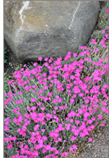
Firewitch Pinks in bloom

Firewitch Pinks is a fine choice for the garden, but it is also a good selection for planting in outdoor pots and containers. It is often used as a 'filler' in the 'spiller-thriller-filler' container combination, providing a mass of flowers and foliage against which the thriller plants stand out. Note that when growing plants in outdoor containers and baskets, they may require more frequent waterings than they would in the yard or garden.