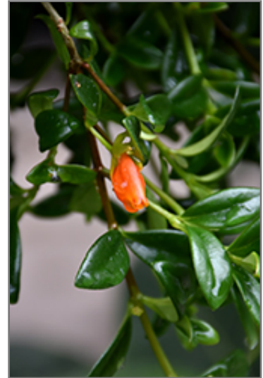
Goldfish Plant flowers

This is a dense herbaceous evergreen houseplant with a trailing habit of growth, eventually spilling over the edges of hanging baskets and containers. This plant can be pruned at any time to keep it looking its best.