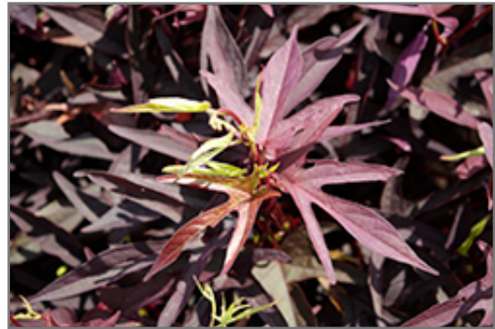
Sweet Caroline Upside Black Coffee Sweet Potato Vine foliage