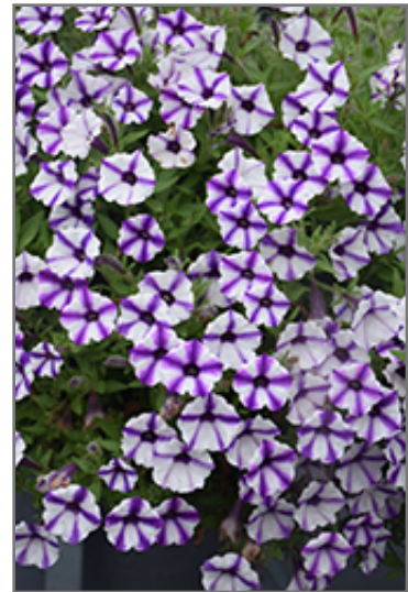
Supertunia Mini Vista Violet Star Petunia flowers

This plant will require occasional maintenance and upkeep. Trim off the flower heads after they fade and die to encourage more blooms late into the season. It is a good choice for attracting butterflies and hummingbirds to your yard, but is not particularly attractive to deer who tend to leave it alone in favor of tastier treats. It has no significant negative characteristics.