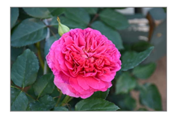
Gabriel Oak Rose flowers