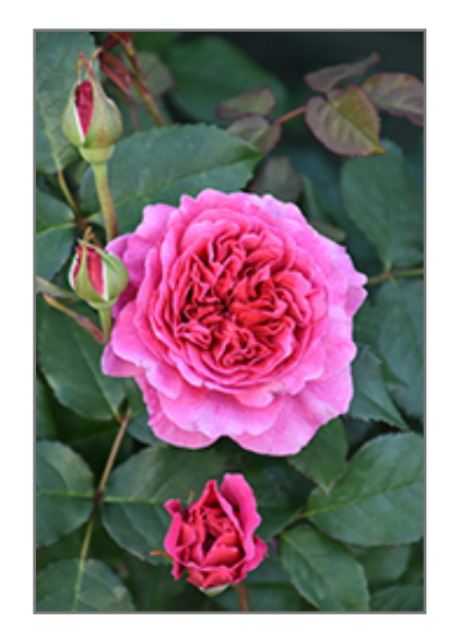
Gabriel Oak Rose flowers