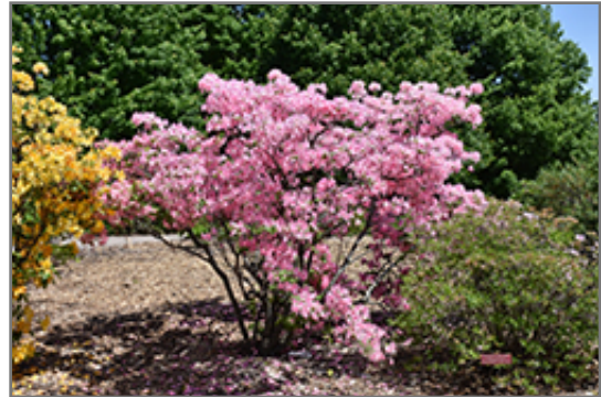
Northern Lights Azalea in bloom