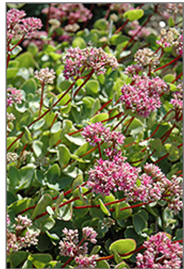
October Daphne flowers