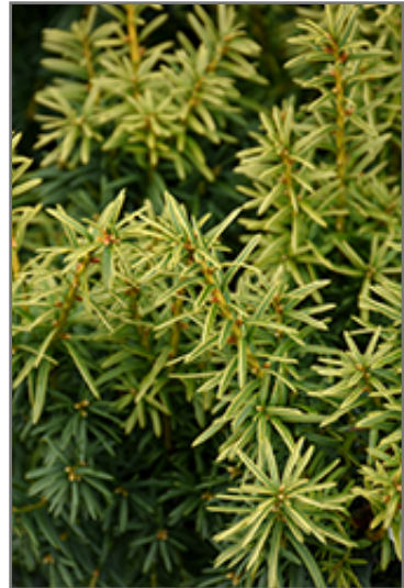
Dwarf Bright Gold Yew foliage