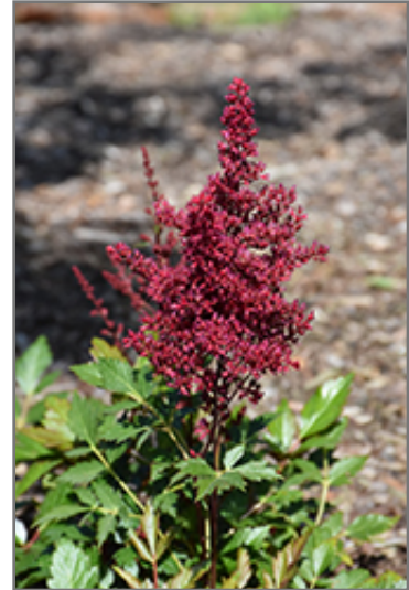
Red Sentinel Astilbe flowers

Red Sentinel Astilbe is a fine choice for the garden, but it is also a good selection for planting in outdoor pots and containers. With its upright habit of growth, it is best suited for use as a 'thriller' in the 'spiller-thriller-filler' container combination; plant it near the center of the pot, surrounded by smaller plants and those that spill over the edges. Note that when growing plants in outdoor containers and baskets, they may require more frequent waterings than they would in the yard or garden.