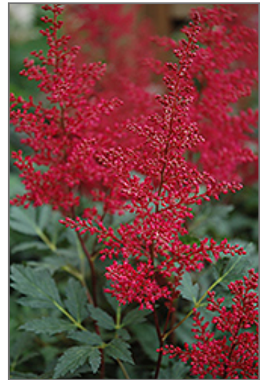
Red Sentinel Astilbe flowers