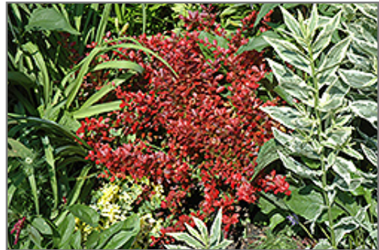
Cherry Bomb Japanese Barberry