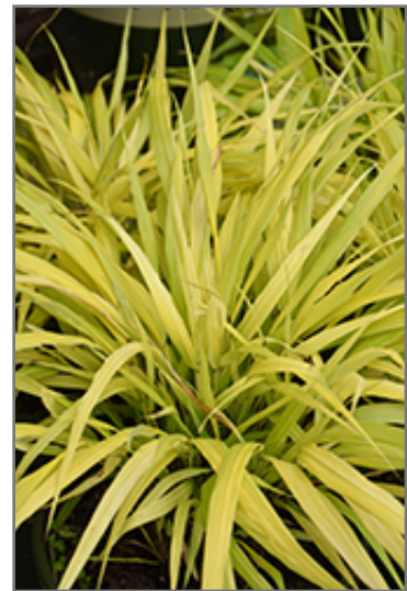
All Gold Hakone Grass foliage