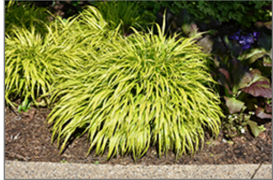
All Gold Hakone Grass