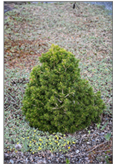
Tompa Dwarf Spruce