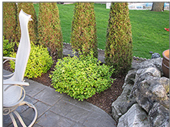
Country Gold Wintercreeper