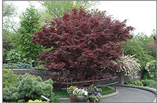
Bloodgood Japanese Maple