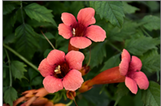
Flamenco Trumpetvine flowers