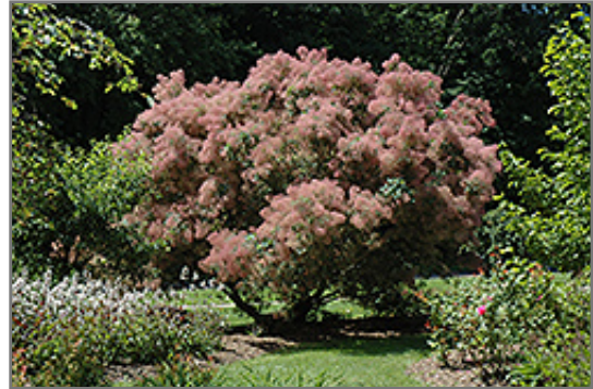
Grace Smokebush in bloom

Grace Smokebush is recommended for the following landscape applications;