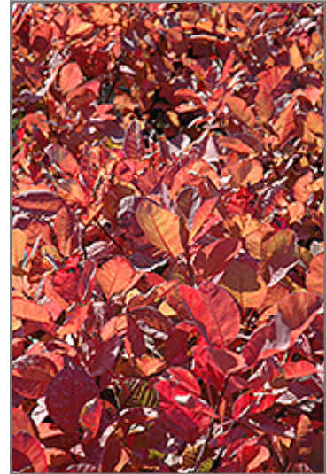
Grace Smokebush in fall

This shrub should only be grown in full sunlight. It is very adaptable to both dry and moist locations, and should do just fine under average home landscape conditions. It is not particular as to soil type or pH. It is highly tolerant of urban pollution and will even thrive in inner city environments, and will benefit from being planted in a relatively sheltered location. This particular variety is an interspecific hybrid.