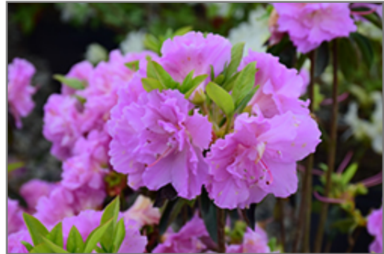
Elsie Lee Azalea flowers