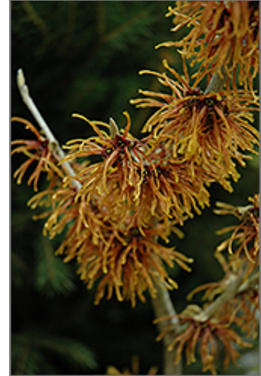
Jelena Witchhazel flowers

Jelena Witchhazel is recommended for the following landscape applications;