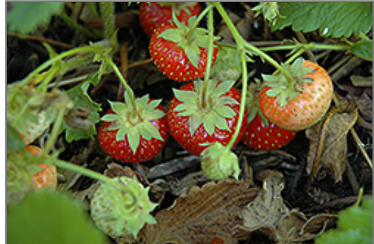
Common Wild Strawberry

Common Wild Strawberry features dainty white cup-shaped flowers with yellow eyes along the stems from late spring to early summer. Its attractive tomentose round compound leaves remain green in colour throughout the season. It features an abundance of magnificent cherry red berries from late spring to late summer.