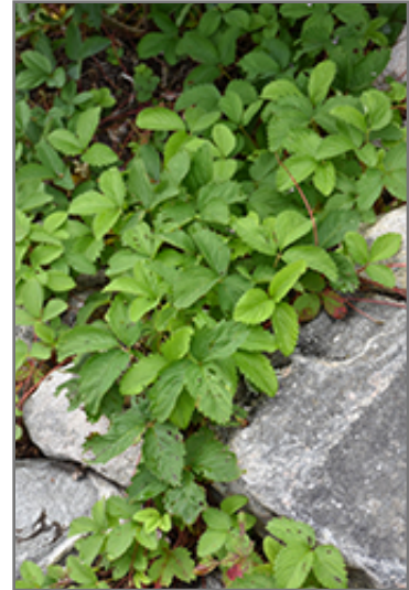
Common Wild Strawberry

Common Wild Strawberry is a good choice for the edible garden, but it is also well-suited for use in outdoor pots and containers. Because of its spreading habit of growth, it is ideally suited for use as a 'spiller' in the 'spiller-thriller-filler' container combination; plant it near the edges where it can spill gracefully over the pot. Note that when growing plants in outdoor containers and baskets, they may require more frequent waterings than they would in the yard or garden.