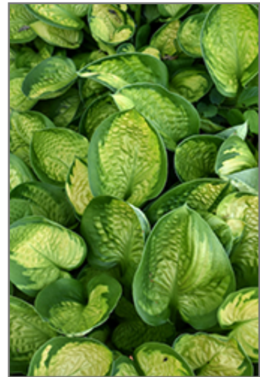
Rainforest Sunrise Hosta foliage

Rainforest Sunrise Hosta is recommended for the following landscape applications;