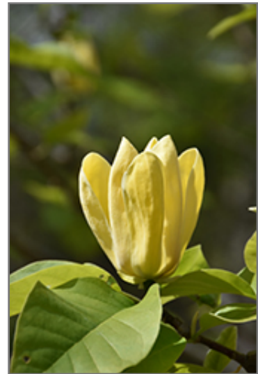
Yellow Bird Magnolia flowers